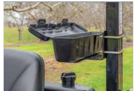
Comfort and Convenience Comfortable ride with deluxe cushioned seat with convenient tool box and cup holder included