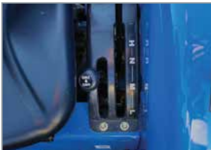
Simple gear range selections Select your gear range or 2WD/4WD with simple move of the levers.