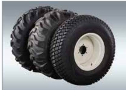
Your choice of tires Choose ag, industrial or turf tires at no additional cost