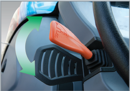
Power shuttle Easily change from forward or reverse with a simple flick of a lever without depressing the clutch pedal.