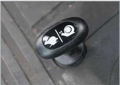
Standard creeper Ultra-slow 0.12mph operation provides increased versatility without the additional cost.