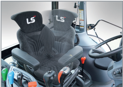
Premium seat The air suspension seat with 10 degree swivel for added comfort.