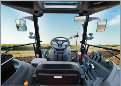
A wide field of vision The hood design combined with a large windshield and the sunroof provide a clear view with minimal obstructions.