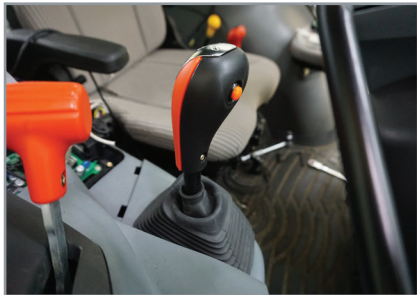
Hand clutch The hand clutch button added to the gear control lever enables you to change gears easily.