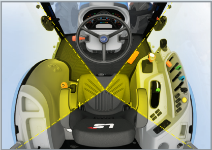
Clear view cabin The spacious cabin offers a clear 360° view of the full working width of attached implements