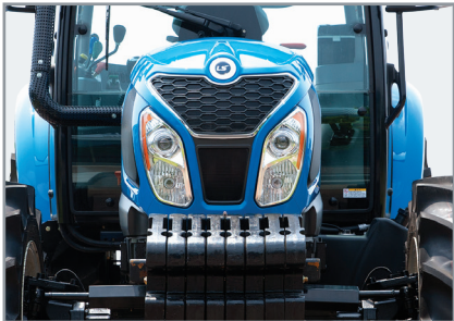
Newly designed headlamps The high-output projection lamp lights up even the darkest of nights.