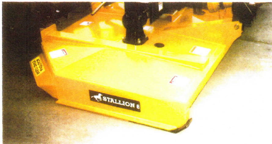
◀ STALLION 8L