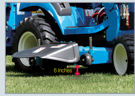
Excellent mower ground clearance The available mid-mount mower is easy to remove or attach and provide a full 6 inches of ground clearance