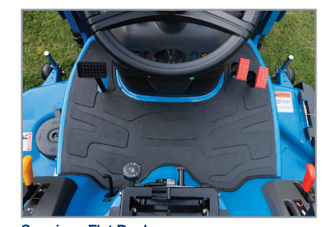
Spacious Flat Deck The full flat deck offers plenty of leg room and makes getting on and off the tractor a lot easier