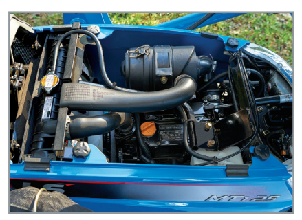
Reliable power and performance Eco-friendly, fuel efficient Yanmar engine delivers quiet reliable power and performance.