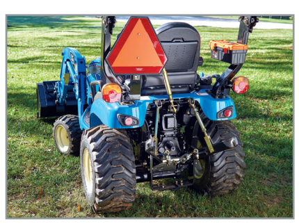
970 lb lift capacity The high lift capacity 3 point hitch is smooth and responsive