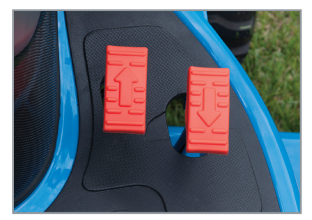
HST dual pedal Maximizes ease of use with effortless speed and directional changes