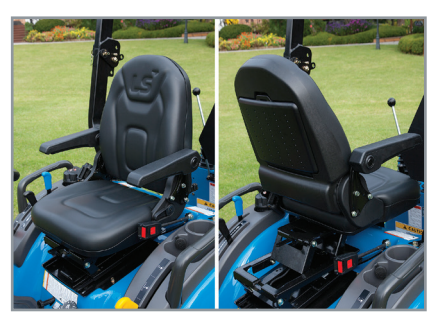
Comfortable High-Back Seat Supportive and comfortable seat reduces fatigue and reverses position for backhoe use