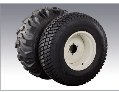
Your choice of tires Your choice of turf or industrial tires at no additional cost