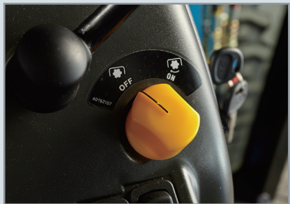
PTO switch Turn the independent PTO on or off with a simple switch