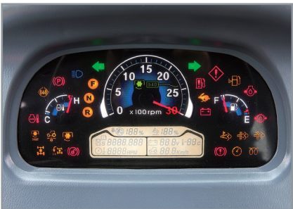
Full function dash panel Important functional data is available at a glance for optimum performance and control