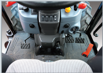
Flat platform With rubber mat and side mounted gear lever, maximizes space, improves operator comfort, and makes getting on/off tractor easier