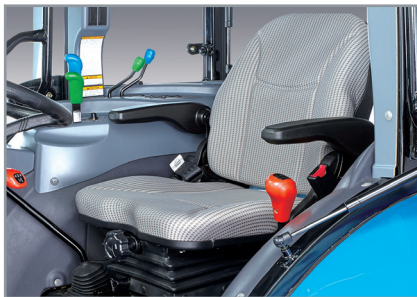
Deluxe adjustable seat with retractable seat belt and arm rests Keeps you safe and comfortable even during long operations