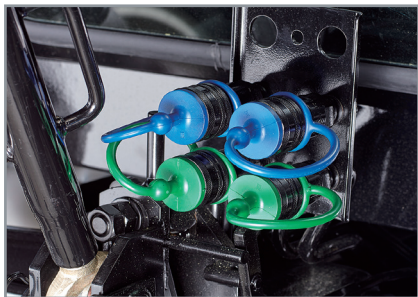
2 sets of remotes and detent function standard Adds functionality and improves ease of use by allowing attachment of hydraulically controlled implements without the high, additional costs like others in its class to add the remotes as options