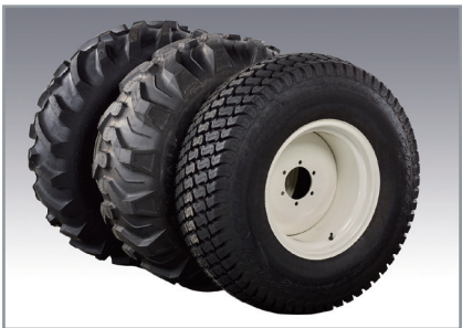
Your choice of tires Choose ag, industrial, ag or turf tires at no additional cost