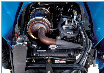
New LS Tier 4 CRDI Engine Meets EPA's most stringent emission standards while delivering rated horsepower quietly with low vibration